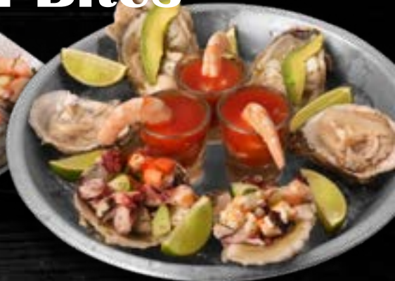
Botana El Patrón 30 00 6 raw oysters (2 plain, 2 with raw aguachil shrimp & 2 with octopus and shrimp, and 3 "balazos" (raw oyster & shrimp with cocktail sauce))