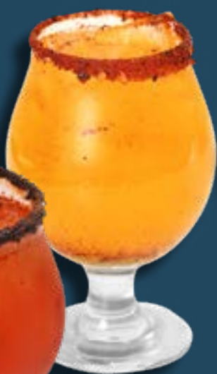
Tamamix 14 Tamarind-Vodka, squirt, orange juice and lime