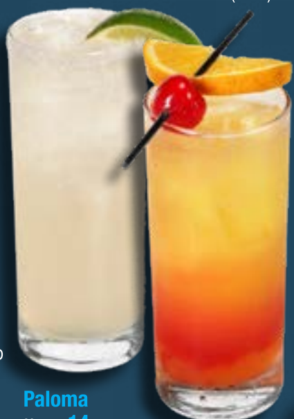
Paloma House 14 Premium 17 Tequila, squirt and lime juice