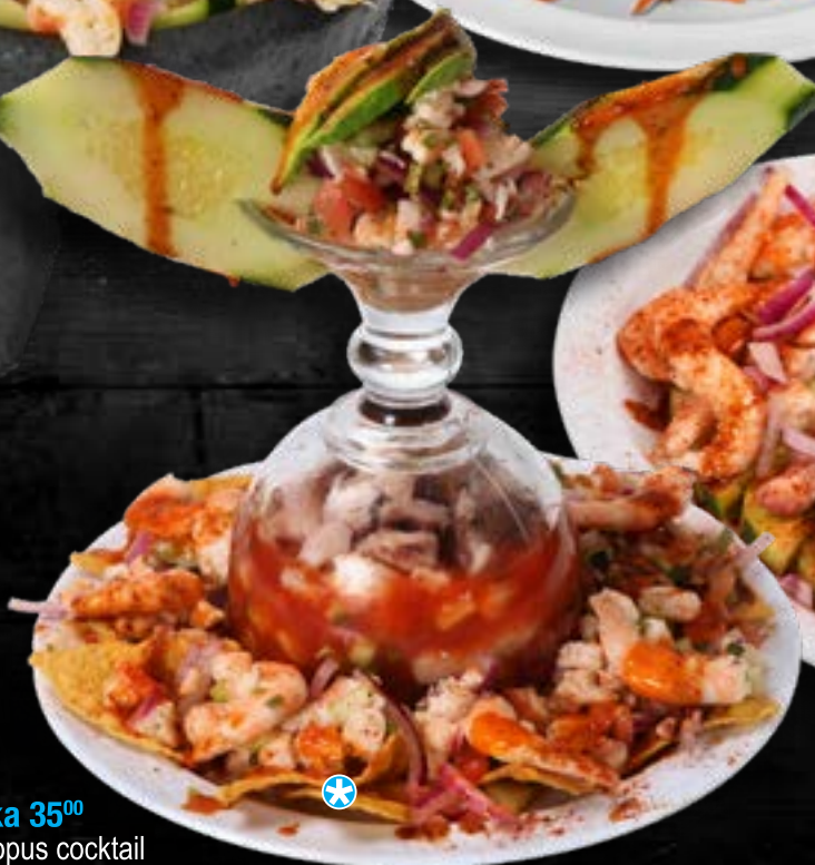
Copa Loka 35 00 Shrimp and octopus cocktail and shrimp ceviche