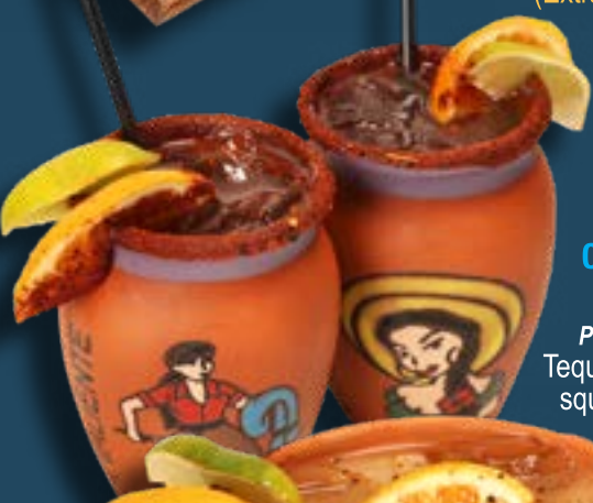
Cantarito House 14 Premium 17 Tequila, sour mix, squirt and lime