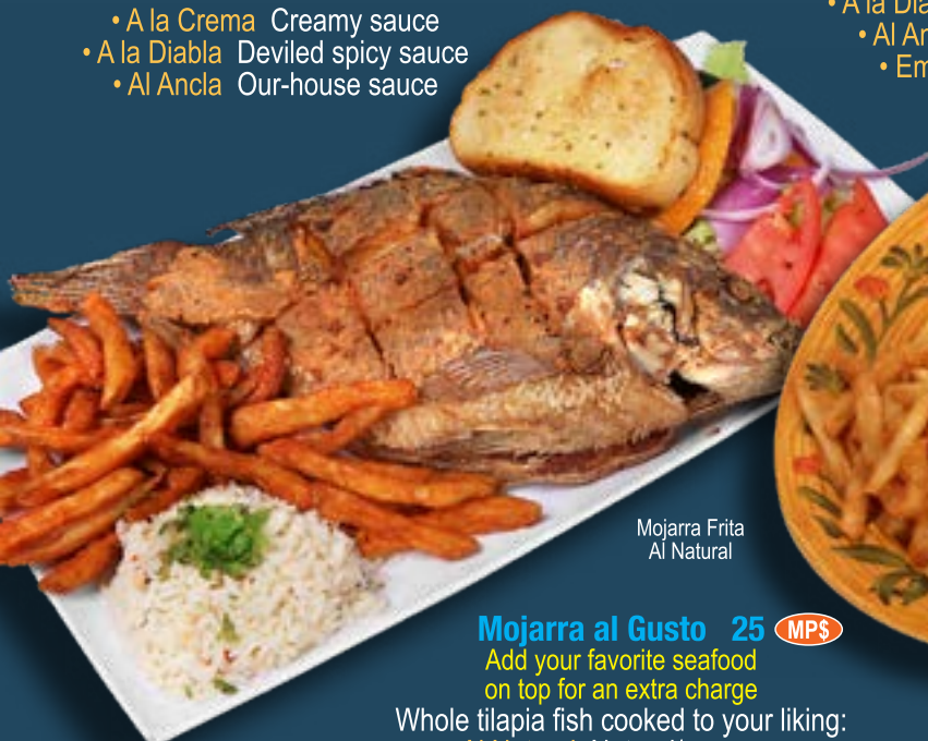
Mojarra Frita Al Natural