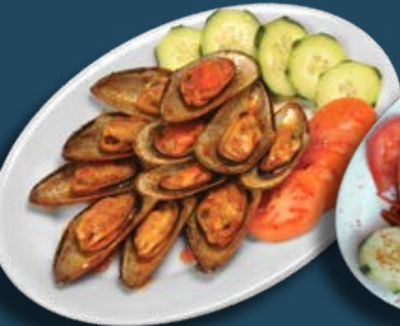
Mejillones Sm (6) 13 99 Md (12) 22 99 Mussels in our-house sauce