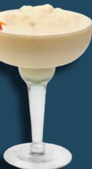
Blue Hawaiian 14 Malibu coconut-rum, blue curacao