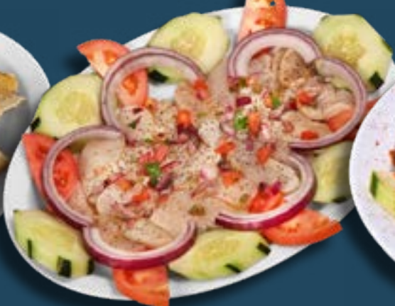
Callo de Hacha Aguachile MP$ Raw scallops marinated in your favorite sauce and lime juice