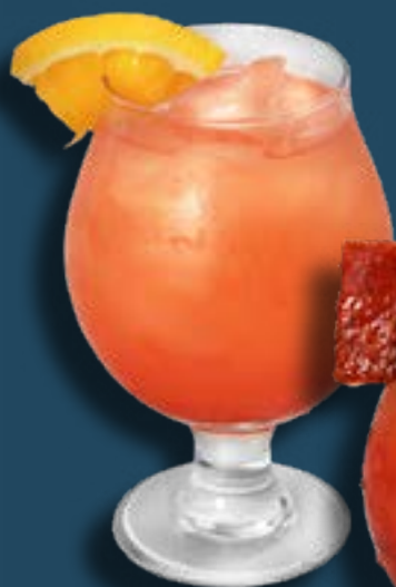
Siete Madrazos 14 Raspberry-Vodka, grenadine, pineapple, orange and cranberry juices