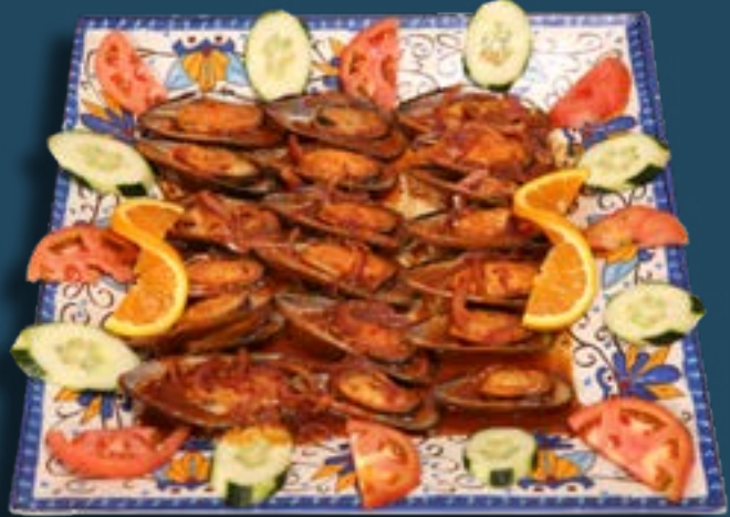
Mejillones (24) 38 Mussels in our-house sauce