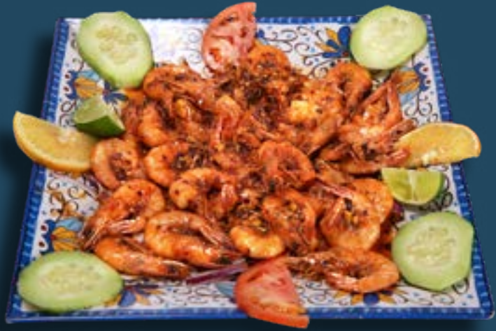
Camarones Cora Reg. 25 Lg 36 Shimp in spicy chile de arbol sauce