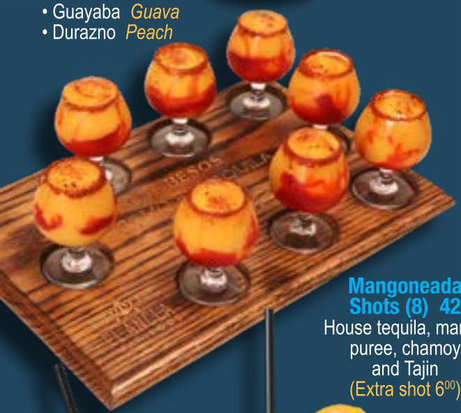
Mangoneada Shots (8) 42 House tequila, mango puree, chamoy and Tajin (Extra shot 6 00 )