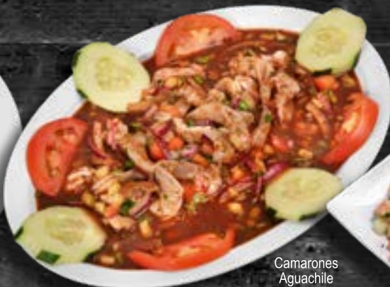
Camarones Aguachile Rojos