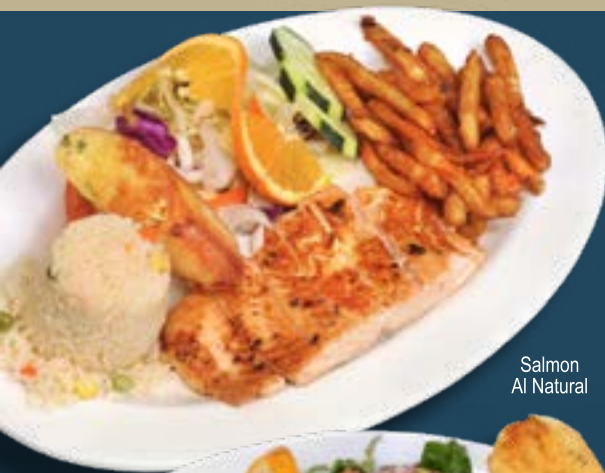
Salmon Al Natural