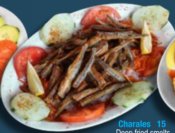
Charales 15 Deep fried smelts