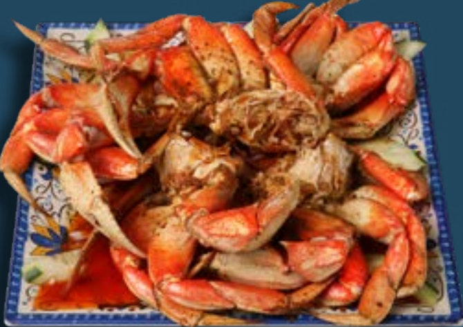
Patas de Jaiba MP$ Crab legs in our-house sauce