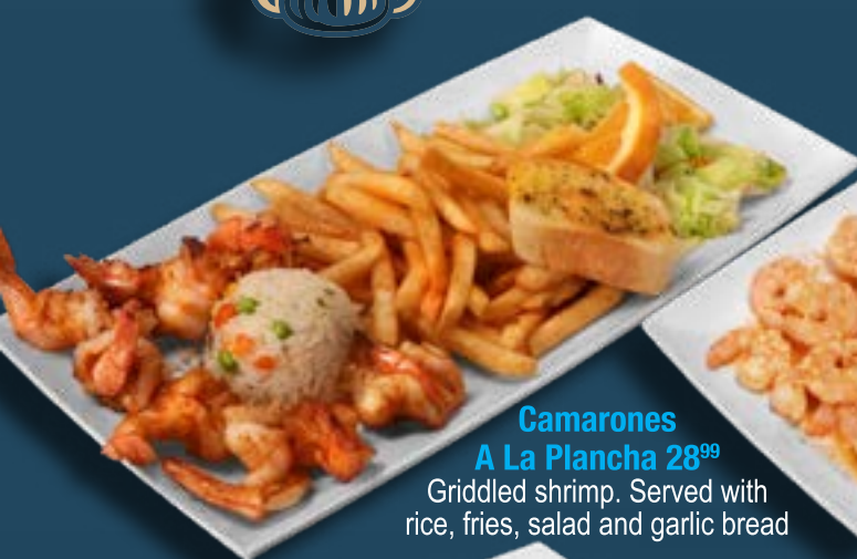
Camarones A La Plancha 28 99 Griddled shrimp. Served with rice, fries, salad and garlic bread

Served with fries, rice, salad and garlic bread