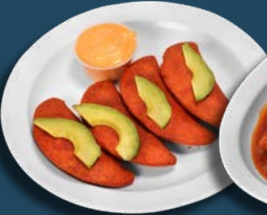
Empanadas de Camarón con Queso (4) 12 (8) 22 Shrimp and cheese pastries