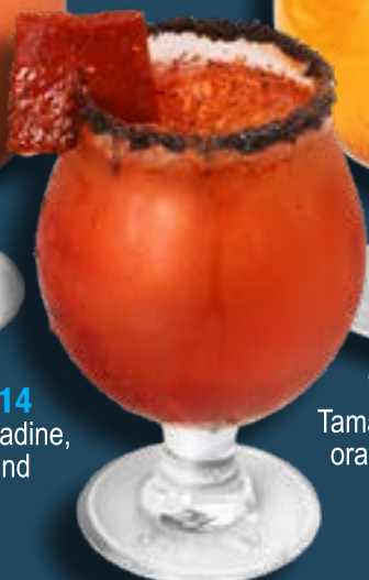
Pulparita 14 Tamarind-tequila, Ancho Reyes liquor tamarind, lime juice, Tajin and Pulparindo candy