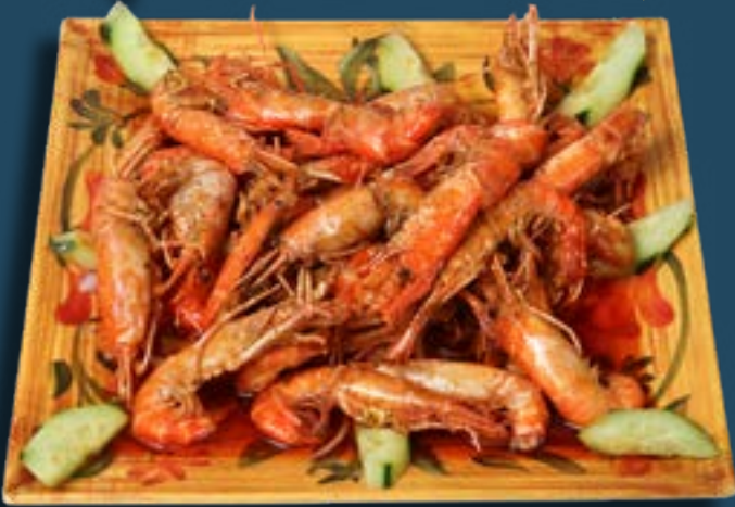
Langostinos Reg & Lg MP$ Prawns in our-house sauce