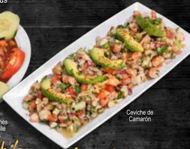
Ceviche de Camarón