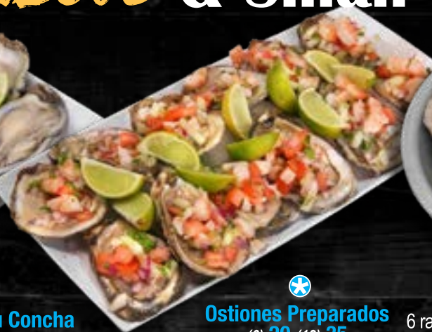
Ostiones Preparados (6) 20 (12) 35 Raw oysters topped with shrimp and octopus