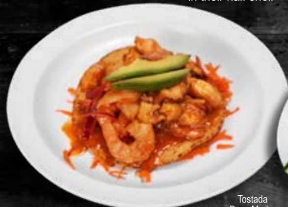
Tostada Poca Madre