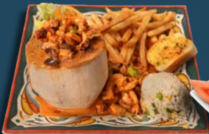
Coco Relleno 32 00 Coconut stuffed with shrimp and octopus in our special El Ancla sauce. Served with rice, fries, salad and garlic bread