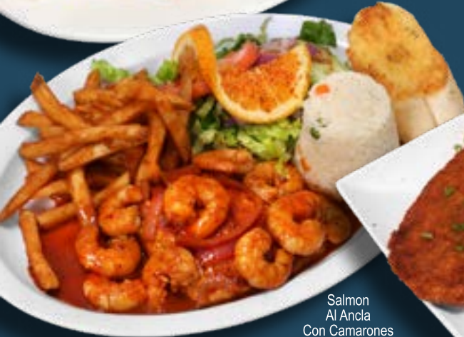
Salmon Al Ancla Con Camarones