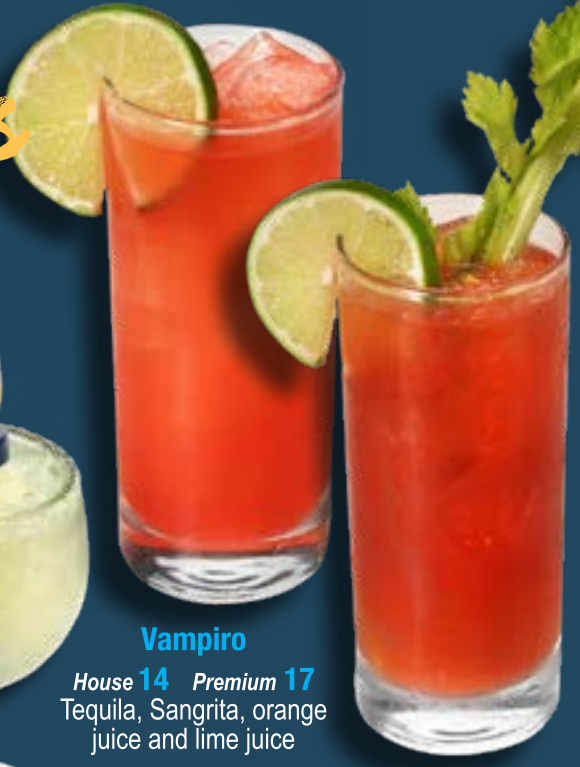
Vampiro House 14 Premium 17 Tequila, Sangrita, orange juice and lime juice