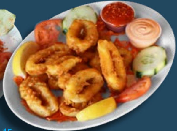
Calamares Empanizados Reg. 21 Al Ancla sauce 25 Breaded calamari