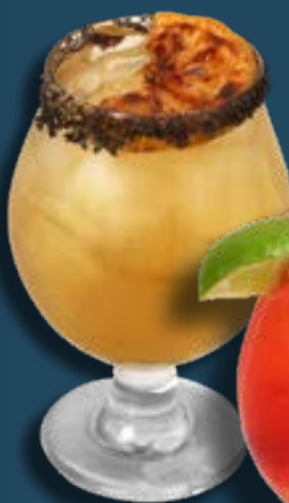
Sweet Oaxaca 15 House mezcal, honey citrus juices