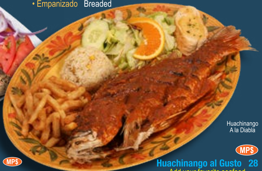
Huachinango Al Diabla