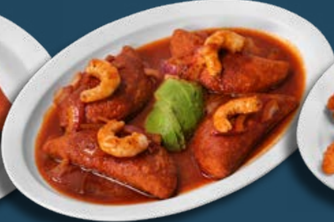
Empanadas Estilo Ancla 4 15 00 8 25 00 Shrimp empanadas covered with El Ancla sauce