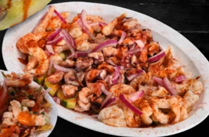
Botana Ancla Served Cold 34 99 Shrimp ceviche, octopus ceviche and raw shrimp aguachile style