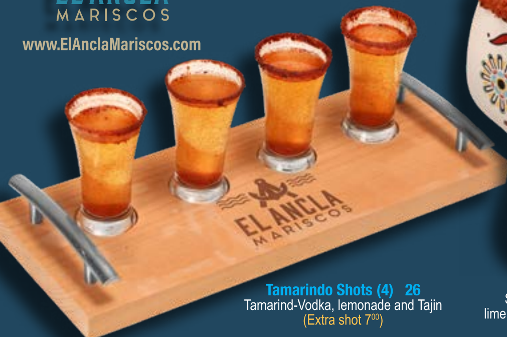
Tamarindo Shots (4) 26 Tamarind-Vodka, lemonade and Tajin (Extra shot 7 00 )