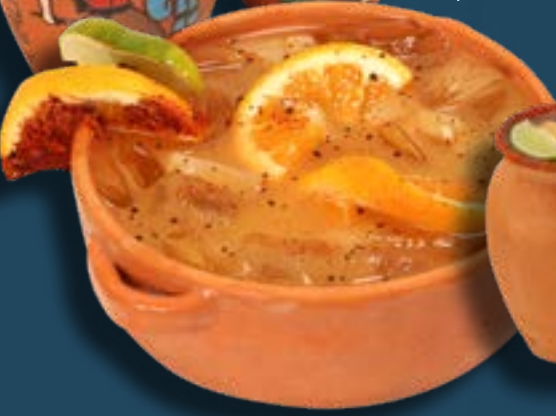
Cazuela Mix 16 Premium 19 Vodka, tequila, orange juice, lime, seven up soda, garnished with orange, lime and slice of pineapple