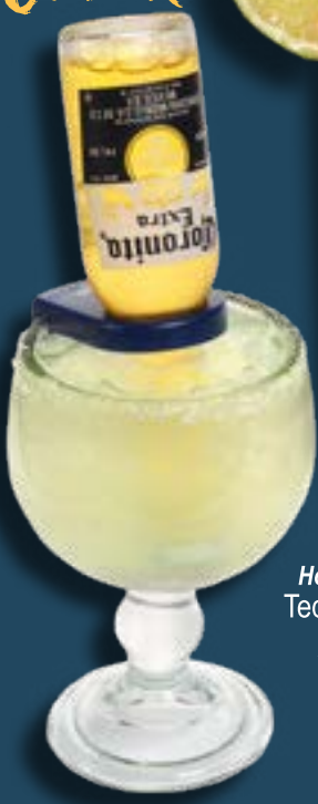
Corona-Rita 16 Your favorite flavor house tequila margarita and one Coronita beer (7 oz)