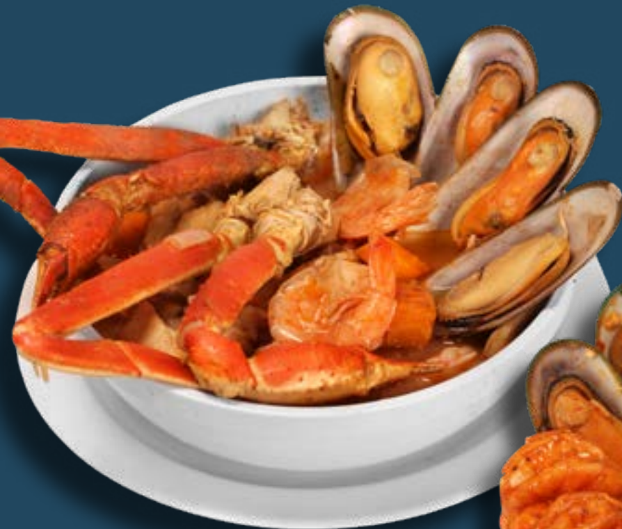
Caldo Siete Mares