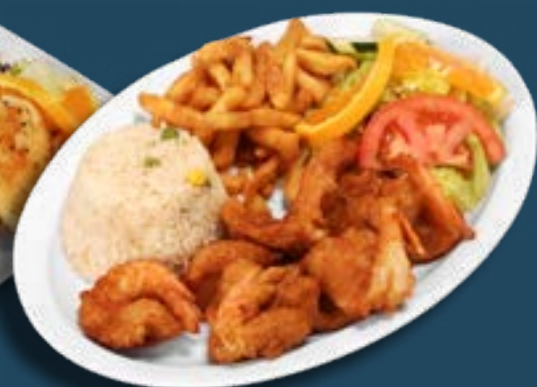
Camarones Empanizados 23 Breaded shrimp