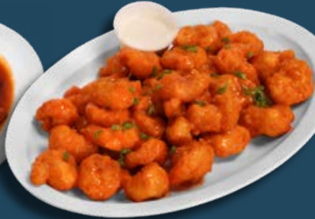
Shrimp Basket 23 99 Breaded shrimp with your favorite sauce: • Buffalo • El Ancla sauce • Mango-Habanero