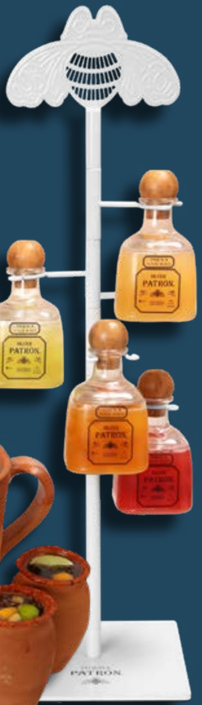
Patrón Stand 42 Your favorite flavor margaritas made with Patrón Silver Tequila