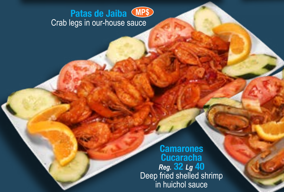
Camarones Cucaracha Reg. 32 Lg 40 Deep fried shelled shrimp in huichol sauce