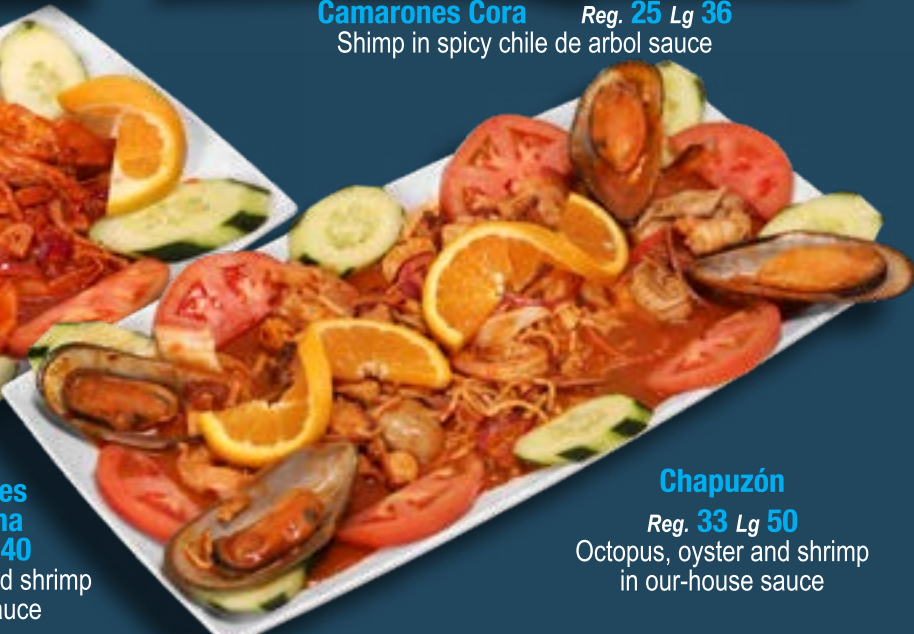
Chapuzón Reg. 33 Lg 50 Octopus, oyster and shrimp in our-house sauce