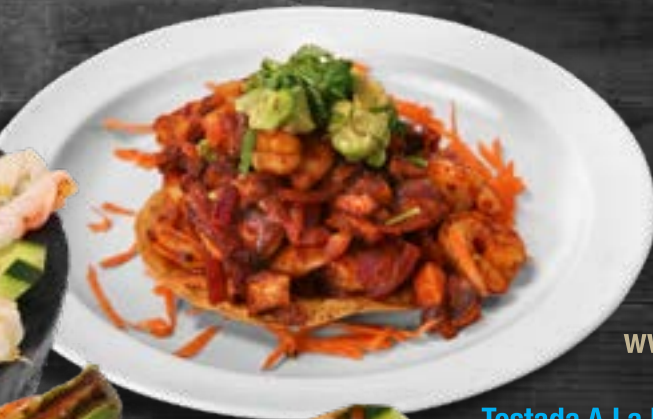
Tostada A La Plancha 13 99 Shrimp, octopus and vegetables