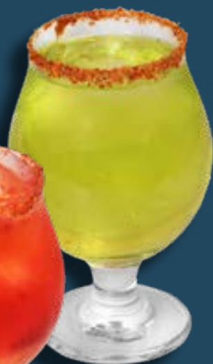
Manzanarita House 14 Premium 17 Tequila, Apple-Smirnoff vodka & sour mix