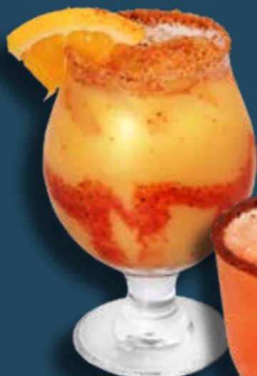
Mango Loco 14 Mango-Rum, orange juice, pineapple juice, Rosse's lime syrup and Tajin