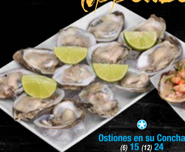
Ostiones en su Concha (6) 15 (12) 24 Raw oysters served in their half shell