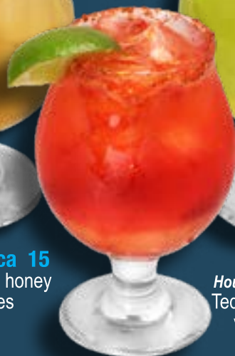
Granadita House 14 Premium 17 Tequila, pomegranate liquor, grapefruit juice and lime juice