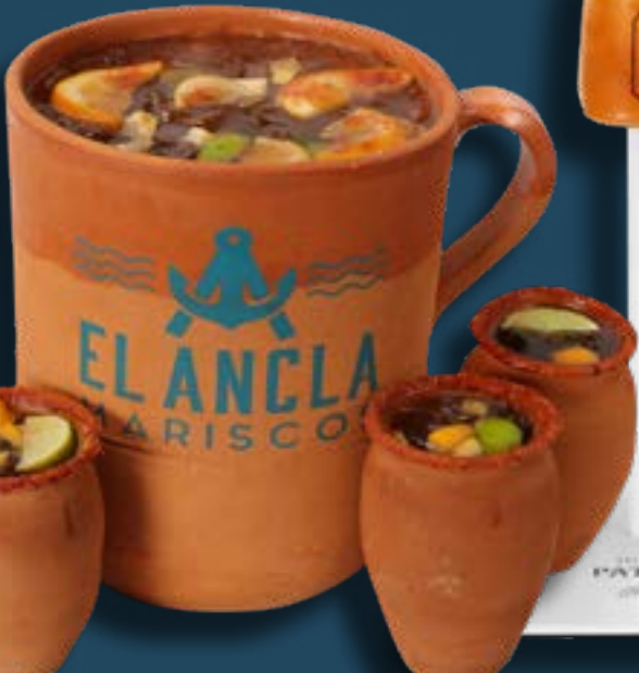
Cantarito Jumbo 180 00 Bottle of Centenario tequila, with Squirt, citrus juices and chopped fruit