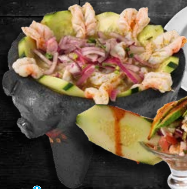
Molcajete Aguachiles 25 00 Raw shrimp marinated in lime juice and your choice of RED SAUCE or GREEN SAUCE