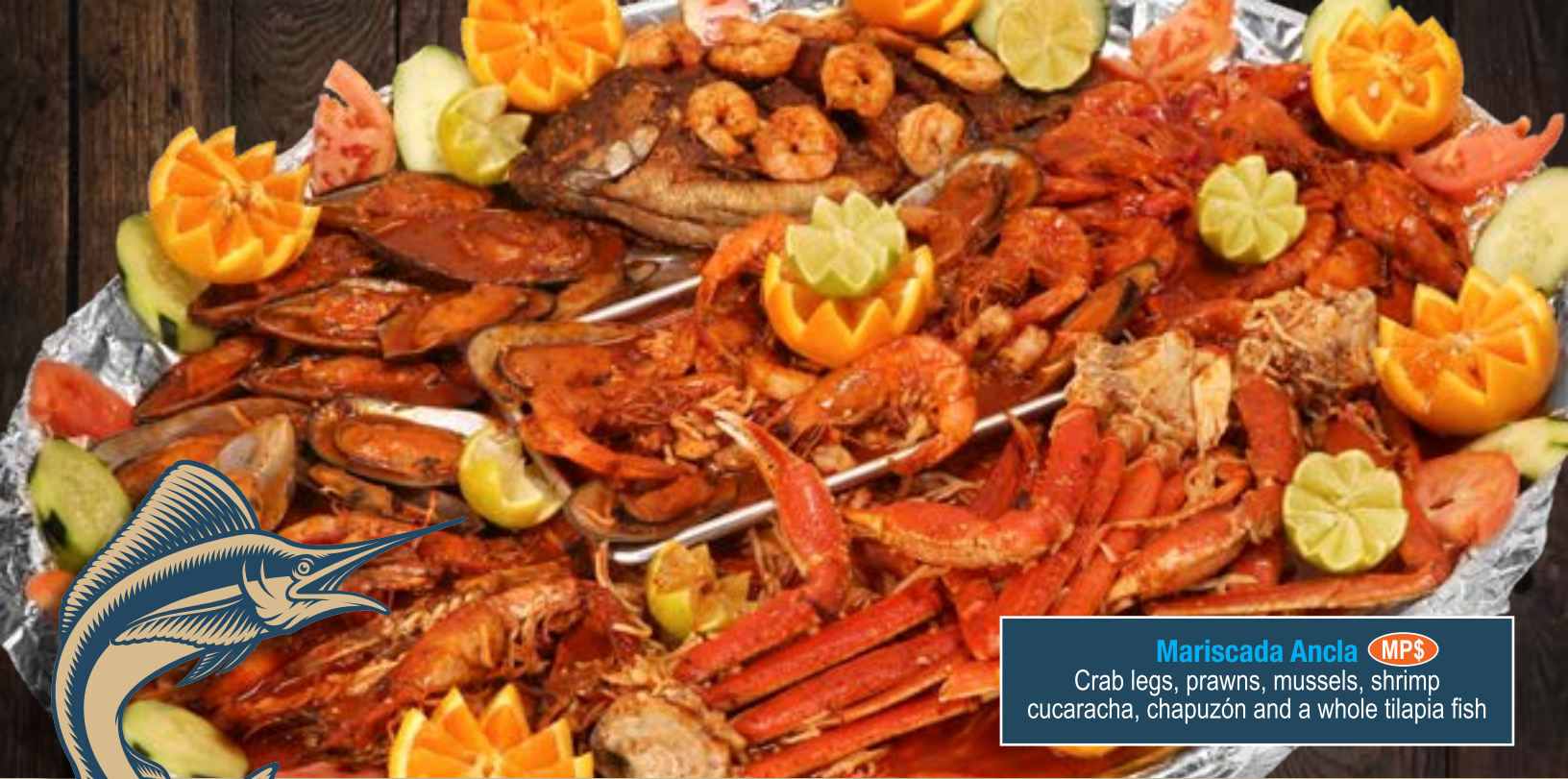
Mariscada Ancla MP$ Crab legs, prawns, mussels, shrimp cucaracha, chapuzón and a whole tilapia fish