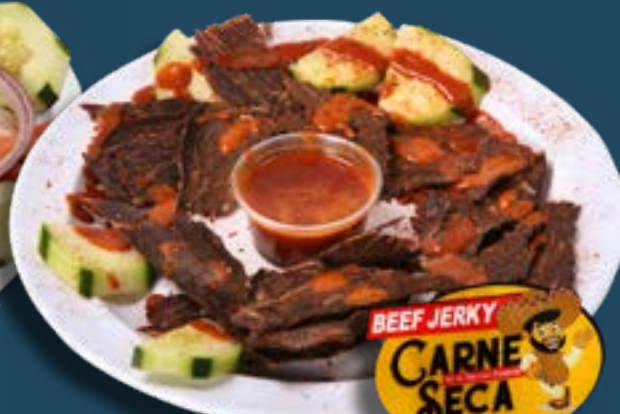
Carne Preparada 13 99 Beef jerky in our-house special sauce