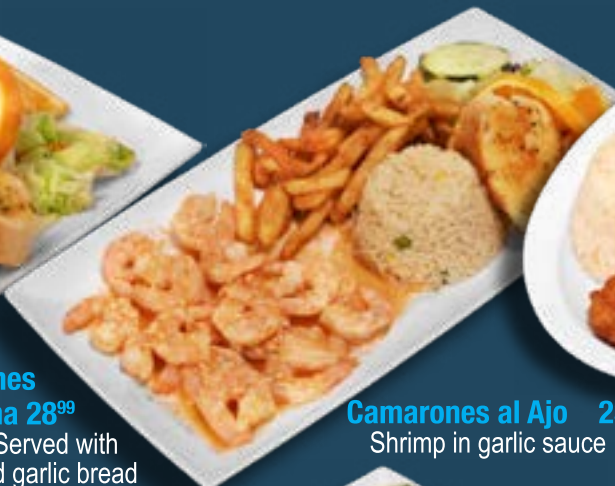
Camarones al Ajo 23 Shrimp in garlic sauce